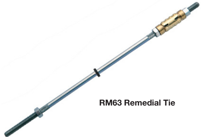
RM63 Remedial Tie

Make good the outer brick using colour matched mortar or mastic.