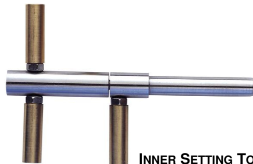
INNER SETTING TOOL